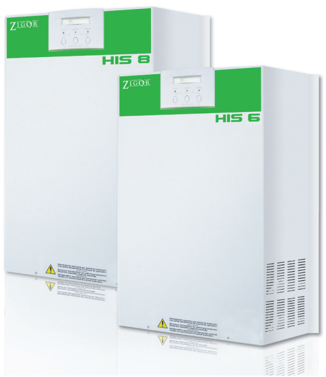
HIS 6 & 8 models

This function allows high energy savings in installations fitted with an emergency power generator. Optionally, they implement management strategies oriented towards energy saving.